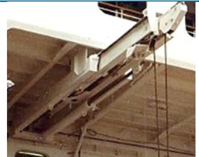
Telescopic davit Standard double-acting hydraulic cylinder