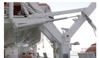
Semi-gravity davit Telescopic type single-acting hydraulic cylinder