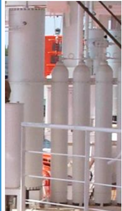
Accumulator and nitrogen bottles