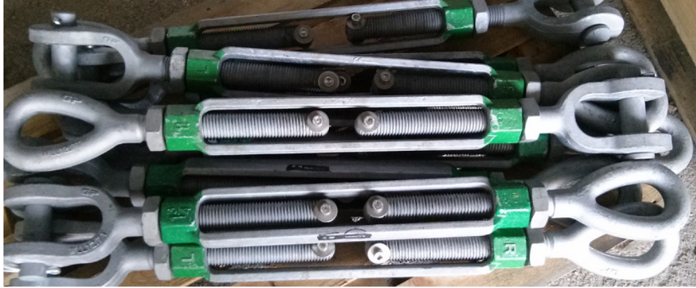
- turnbuckles with safety bolts -

The use of this new turnbuckles is therefore recommended as preventive measure on the above Navalimpianti-Tecnimpianti Davits.