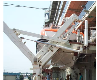
Semi-gravity davit Bladder accumulator