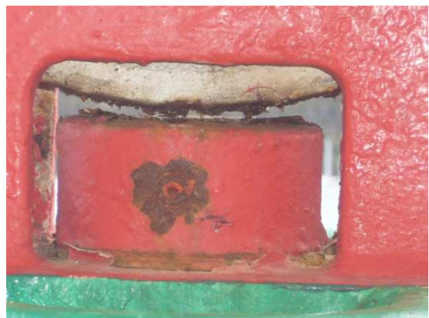
5 - Another swivel nut of the same vessel. The corrosion starts from the elastic pin.