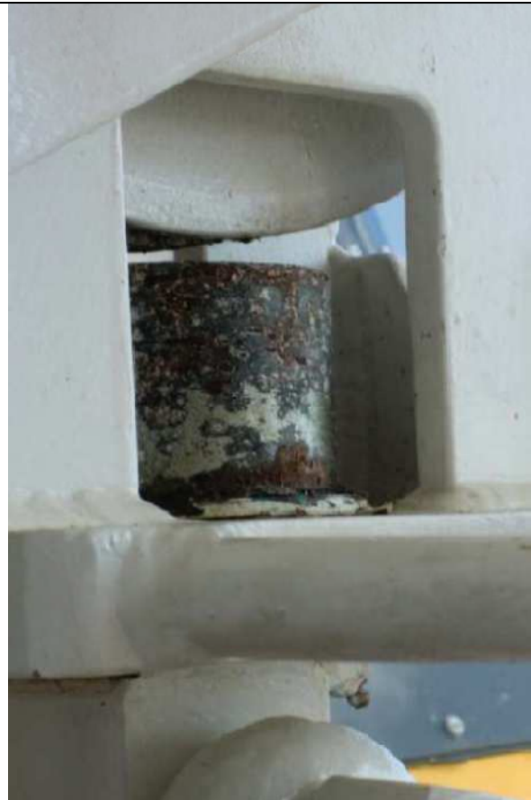
2 - Intermediate corrosion status