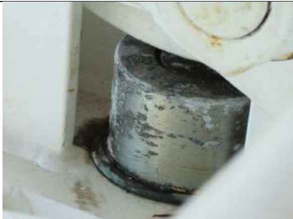
1 - Starting corrosion in the first service year