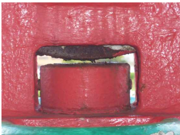
4 - Painted swivel nut well maintained after more than five service years.