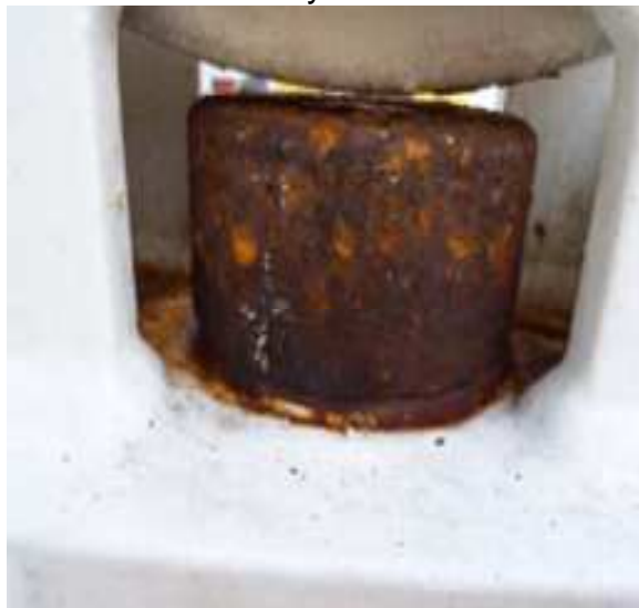
3 - Severe corrosion after about two years without maintenance